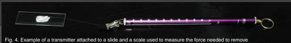
Fig. 4. Example of a transmitter attached to a slide and a scale used to measure the force needed to remove

Brigham, R. M. 2008. Transmitter Attachment for Small Insectivorous Bats (<30 g). Holohil Systems Ltd. http://www.holohil.com/bd2att.htm .