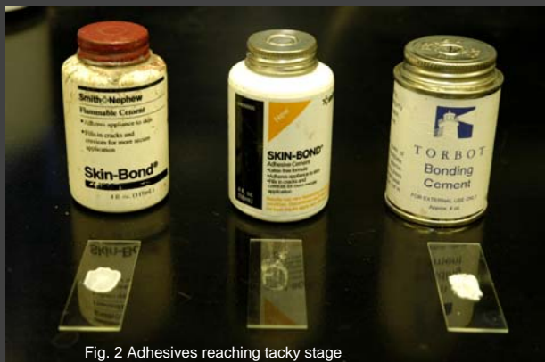
Fig. 2 Adhesives reaching tacky stage