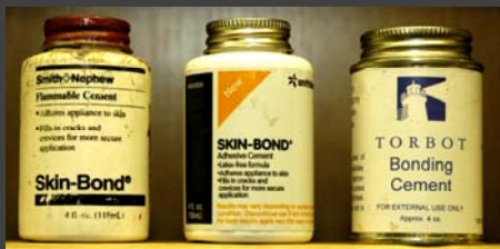
Fig. 1 Example of bottles for each adhesive

2 Department of Biology, Ball State University, Muncie, 47306 IN